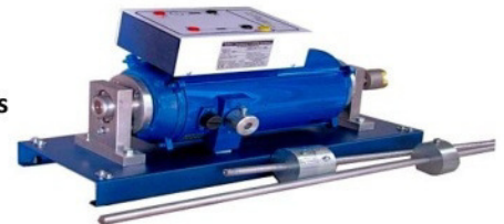
Generator has continuous current with balance

Machine of industrial version on metal base mounted in balance