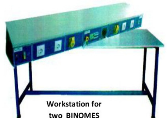
Workstation for two BINOMES

Work table for two pairs with a console of power supply