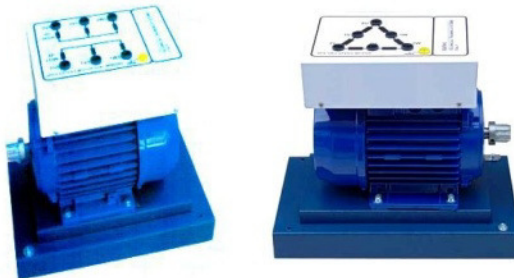
Asynchronous motor has cage has 2 speeds

Asynchronous motor a cage to 2 speed sépare windings mounted on metal base with 4 rubber feet anti vibration