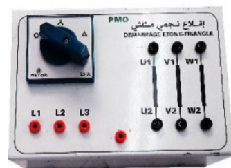
Starter Etoile triangle for asynchronous machine

For engine of power less than or equal to 500W didactic version