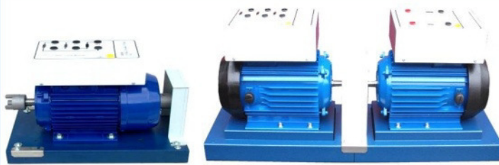
Asynchronous motor a cage

Mounted on metal base with 4 rubber feet anti vibration and with a possibility of coupling with other machines