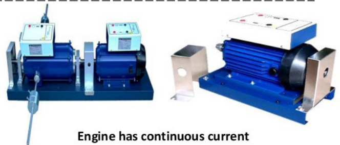
Engine has continuous current

Dc motor of industrial version on metal base